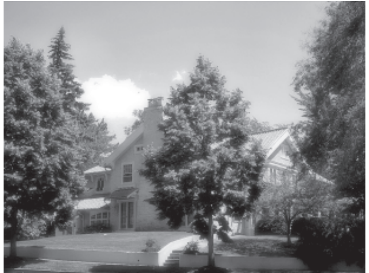
1415 West Washington Blvd.