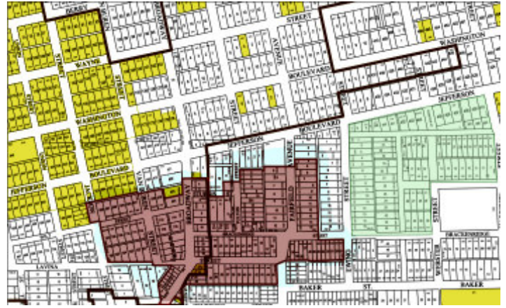
The area proposed for addition to the neighborhood's Local Historic District is the shaded area in the lower center of the map shown above.

The West Central Neighborhood Association recently began laying the groundwork for a campaign to increase the area of the neighborhood that has been designated a Local Historic District (LHD). As part of the city government's plan to preserve and protect the area surrounding the Harrison Square development, the LHD designation will help to maintain the character of our neighborhood while increasing the value of the properties therein. The major benefit will be to protect property owners from inappropriate alterations or construction on adjacent properties. The major requirement of the designation is that changes to any elements of the property subject to public view must undergo a design review process. Association Secretary Charlotte Weybright chairs the committee guiding our side of the campaign.