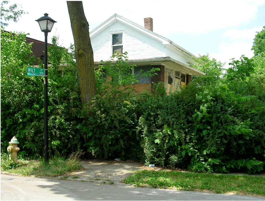
A vacant house at 1134 Nelson Street before and after the WCNA cleanup effort. We can make a difference. Thanks to all who helped.